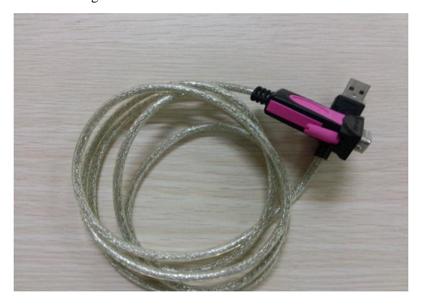
A USB cable to serial port

(2) connecting line : UPS dedicated RS232 9 pin serial port or USB cable, for customers to use RS - 232 serial port connecting, connect one end of the female head on UPS system RS - 232 communication port, male head connect the computer serial port (if the USB to serial port line can be directly on the computer's USB port). If the system only 25 pin of the communication port, user can use 9 pin on the 25 pin connector to connect; For customer use USB connecting , with a dedicated USB data communication line to the computer connected to the UPS. Three kinds of connections line as shown in figure.