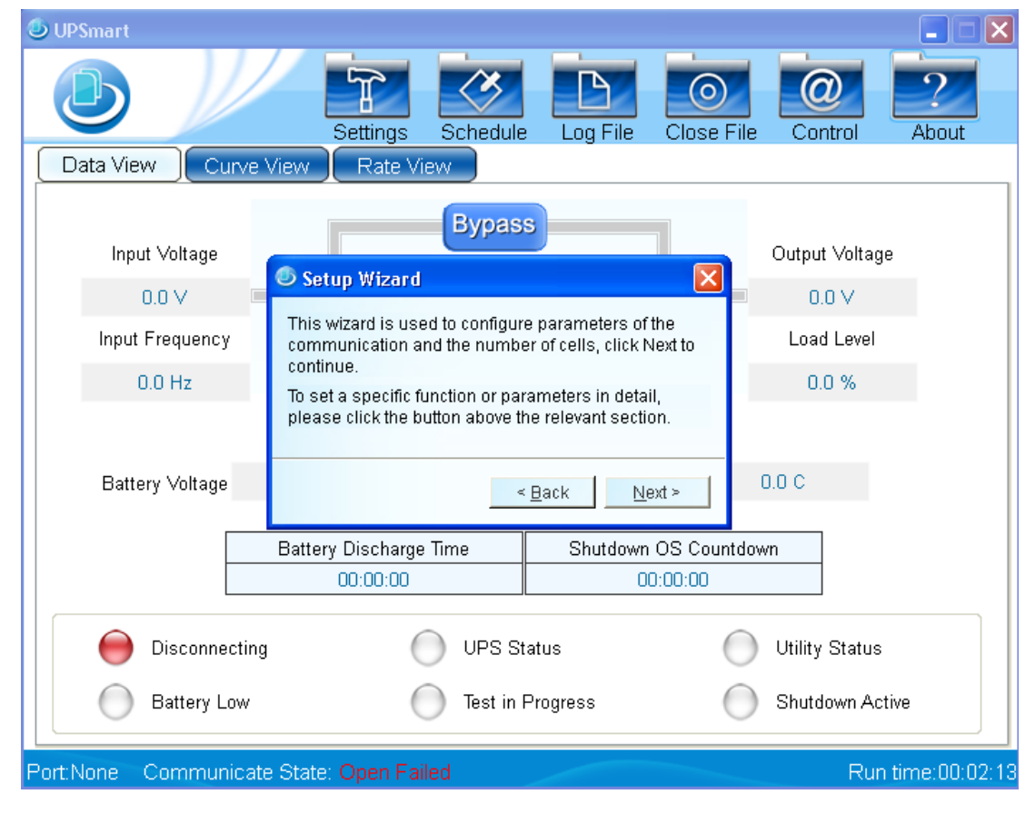
(2) Quickly set up monitoring mode and the communication port, as follow figure

(1) Firstly running software as follows figure